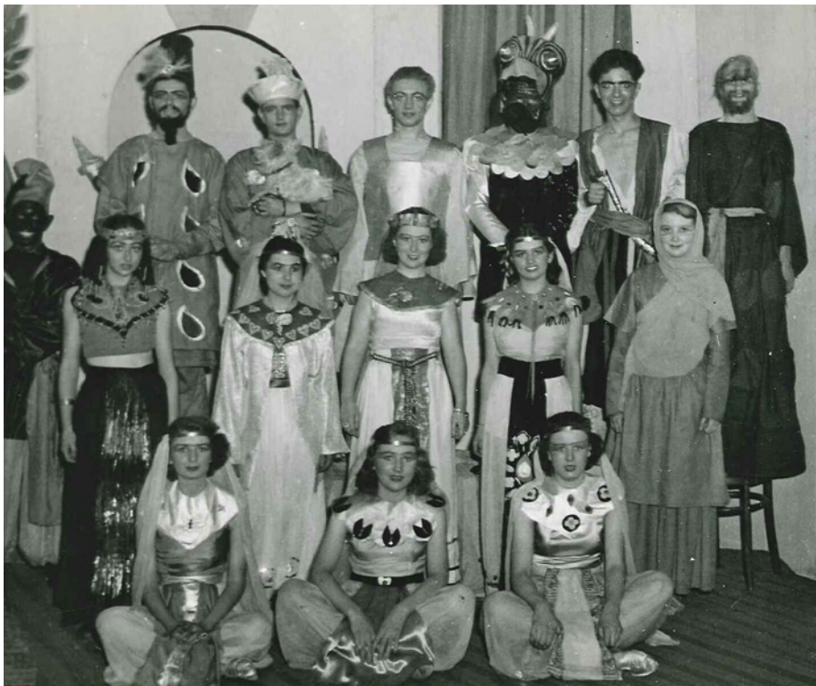
Tobias and the Angel - 1965

Theatrical productions at Whitby School.