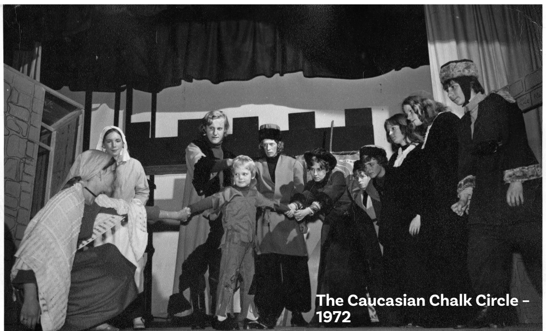
The Caucasian Chalk Circle - 1972