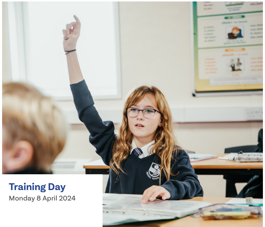
Training Day Monday 8 April 2024