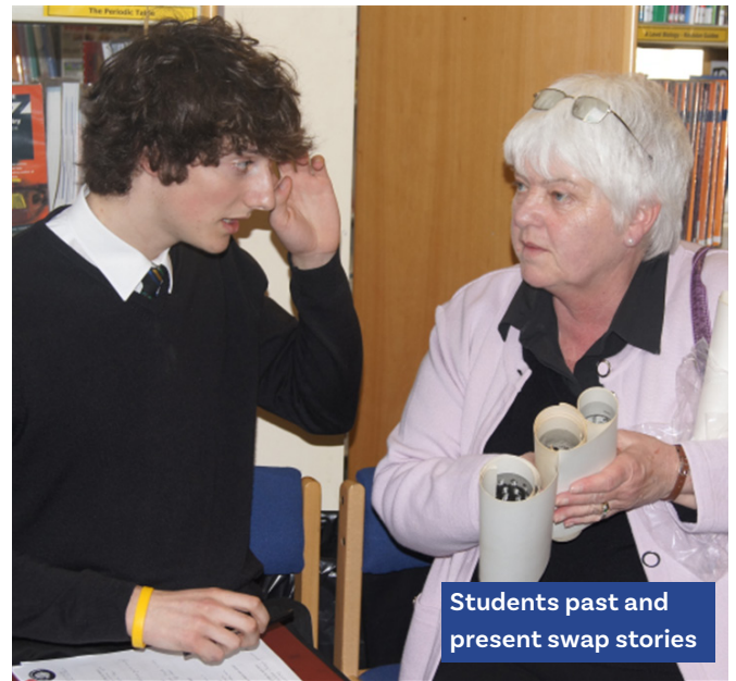
Students past and present swap stories

The afternoon was incredibly successful and was enjoyed by all. Approximately 30 students took part in the afternoon and enjoyed 'meeting and greeting' the visitors, comprising past pupils and teaching staff. Throughout the afternoon, a film of the school from the past was played and the guests were able to give the students information about the film, including names of people to contact in order to find out more information. As well as the film, there were numerous display boards around the Learning Centre with past exam results, photos and school records which dated back to the earliest days of the